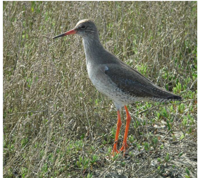
Redshank