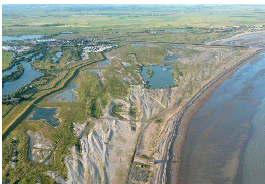
Part of Rye Harbour Farm and the adjacent Local Nature Reserve 2008

On 6 th May we submitted a planning application for the works to Rother District Council. Details of how you can view the planning application are overleaf.